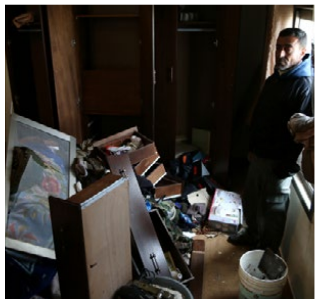
Soldiers invade the Tamimi family home in the village of Nabi Salah, August 23, 2020.

The secondary importance the military ascribes to protecting Palestinians' rights when intruding into their homes is reflected in the absence of binding, publicly accessible directives on protecting these rights, such as directives intended to prevent arbitrary damage to property. It is also reflected in soldiers and officers' lack of familiarity with directives concerning the protection of minors when their homes are invaded or when they are arrested. Without such directives, the extent to which the rights of household members are violated varies according to the personality and whim of the commander on the ground.