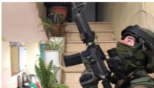
Soldiers invade the Tamimi family home in the village of Nabi Salah, August 23, 2020.

Consequently, home invasions may seriously impede daily functioning and the emotional and mental development of both adults and children. In addition, frequent home invasions in a specific area (a city, village or neighborhood) may also interfere with relationships within society or the community and produce a climate of fear and intimidation.